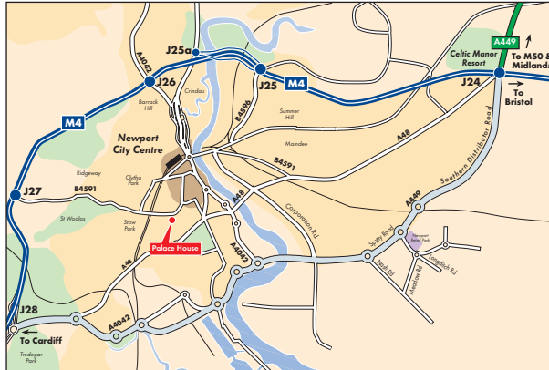
Plans are for identification purposes only. Not drawn to scale.